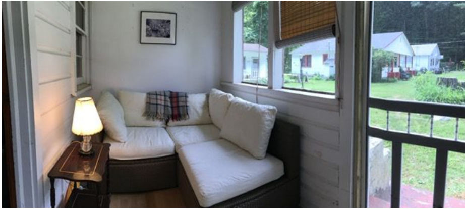
Reading nook / sitting room