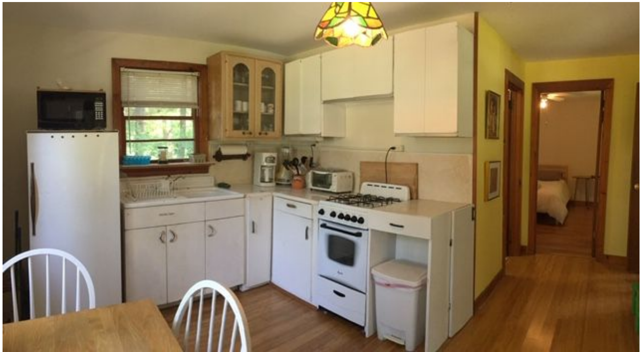
Kitchen / Common Room